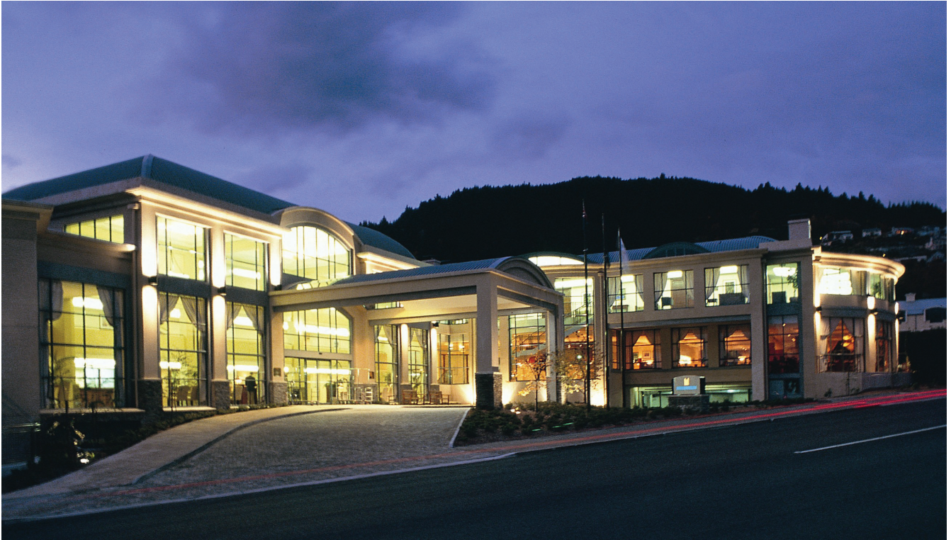
Entry to Millennium Hotel, Queenstown